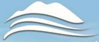
Table Rock Lake Chamber of Commerce